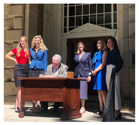
Shatterproof's VP, State Policy, Courtney Hunter, with Governor Sisolak of Nevada for the signing of the bill to protect opioid settlement funds.